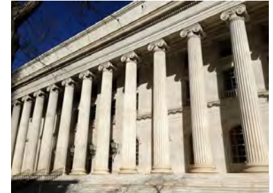
The U.S. Court of Appeals for the 10th Circuit where MCVRC filed a brief in support of the Utah Crime Victim's Legal Center and a federal trial court ruling in Utah.

It is anticipated that oral arguments will be set in late fall and that a decision will be issued in 2015.