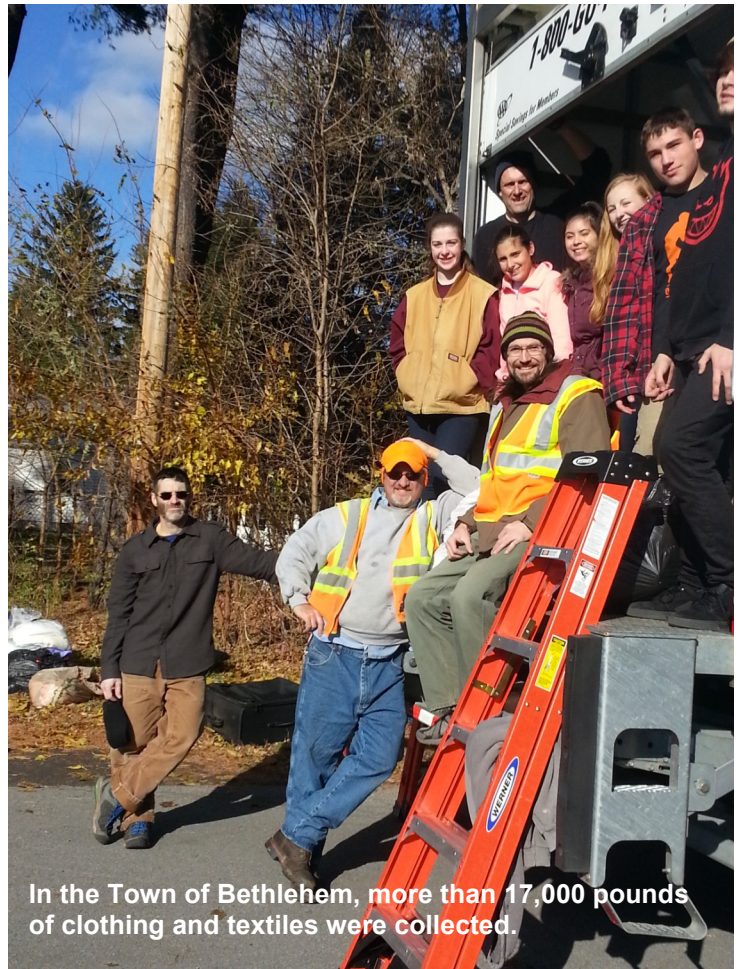
In the Town of Bethlehem, more than 17,000 pounds of clothing and textiles were collected.

In addition to holding collection events, many communities also passed resolutions supporting Clothes The Loop NY, made pledges in support of increased textile recovery, and expanded existing clothing and textile collection programs. Visit www.NYTextiles.org for details and updates on the campaign!