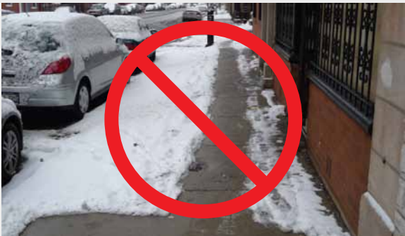
This path does not meet the width required in the Municipal Code.