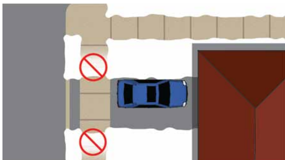
When clearing driveways or walkways do not block the sidewalks with snow.