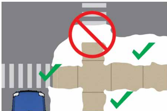
Do not push snow from driveways or sidewalks into the street or over crosswalks.