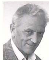
Dr. Peter Safar

It has been an outstanding year at the Safar Center for Resuscitation Research. Investigators are working in four areas of research: traumatic brain injury, cardiopulmonary arrest, disaster medicine, and shock and suspended animation. The 1996-1997 annual report of the Safar Center for Resuscitation Research, published in October 1997, describes 32 peer-reviewed papers, 265 chapters, and 52 abstracts generated by Safar Center investigators last academic year. Safar Center scientists currently have 31 grants, of which 25 are extramural, totaling over $7.8 million in funding.