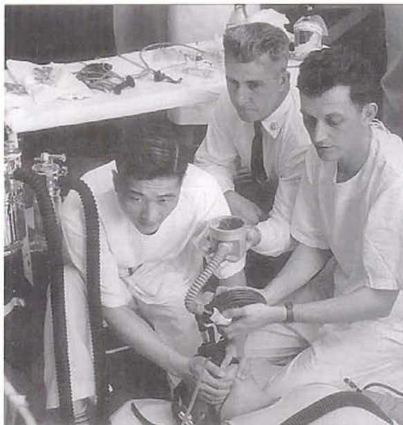
A youthful Peter Safar (right) and associates "bag" a volunteer during resuscitation research conducted at Baltimore City Hospital in the 1950s.

The American Society of Anesthesiologists selected Dr. Safar to deliver the Lewis H. Wright Memorial Lecture for the noteworthy year of 2000. Dr. Safar presented his lecture, "On Resuscitation Medicine from 1000 to 2000 C.E.," October 17 at the ASA's Annual Meeting in San Francisco. The major portion of his talk focused on