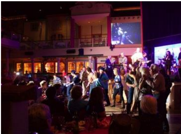
Dancing, Fun & Laughter at Crystal Palace