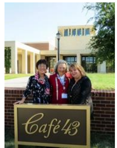
Federated Women from CA & NY meet in Dallas!