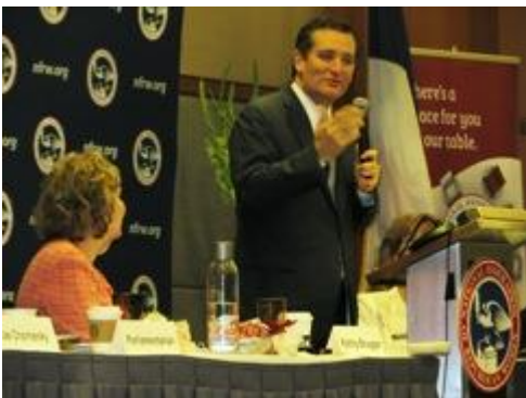
Senator Ted Cruz