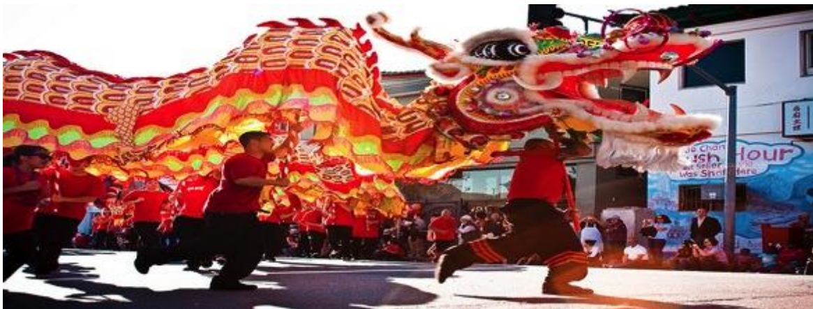
Image from the 2014 Los Angeles New Year

GOAT: Except for the knack of always getting off on the wrong foot with people, the Goat can be charming company. You are elegant and artistic but the first to complain about things. Put aside your pessimism and worry and try to be less dependent on material comforts. You would be best as an actor, gardener, or beachcomber.