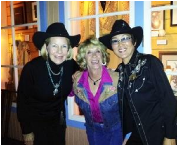
Temecula Valley RWF 'Cowgirls'