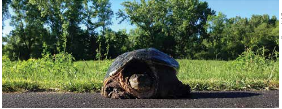
Watch out, turtle crossing on trail!