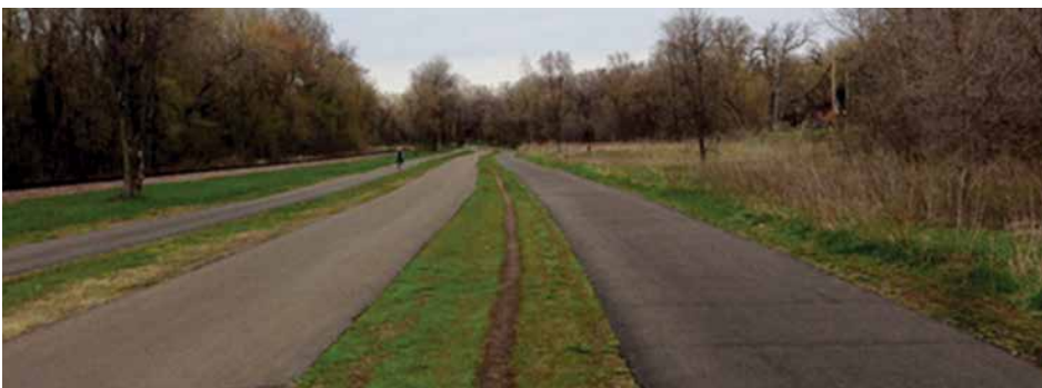
Looking north in the Kenilworth Greenway.

CLPA is concerned about preserving the integrity of Cedar Lake Park's Prairie and Regional Trail. The breathtaking view from the park into downtown Minneapolis has become an iconic image of the city. Along the edge of the prairie, the Cedar Lake Regional Trail moves thousands of bicyclists and pedestrians every day. CLPA advocates minimizing the human footprint and protecting the natural environment in this area just a stone's throw from the heart of the city. Before, during, and