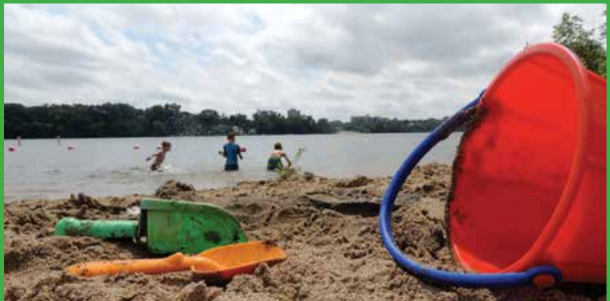
The perfect tools for a fun Friday spent digging, building, and splashing!

Running Club Cedar Grove Service Day July 27, 2014