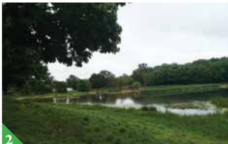
2 With Cedar Lake in the background, these settling ponds on the southwest side filter much of the water from the west before it flows into the lake.