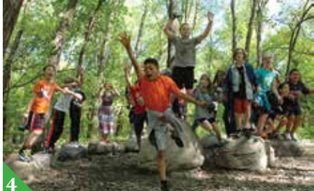
4 Kenwood School kids are happy on the rocks of Linda's Spiral during a recent outing in the park.