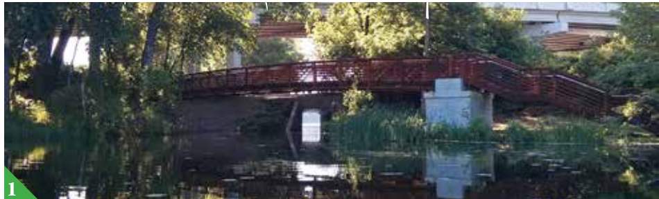
1 On Brownie Lake looking through the tunnel to Cedar Lake, the new pedestrian bridge is in the foreground with the recent Cedar Lake Pkwy bridge above.

Work in the Burnham Woodland Restoration is ongoing, including the annual Yale Day of Service in May when alumni volunteers and their families come to the area to help out. Located just north of the west end of the Burnham Bridge, the transformation of this area from buckthorn infested to oak woodland has been driven by a volunteer's vision, passion, and many, many hours of work. It is a beautiful thing.