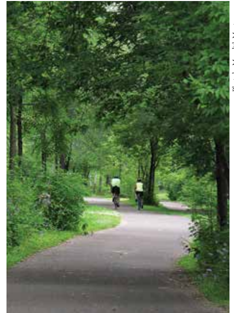
Bicyclists enjoying the lush green canopy over the trails.