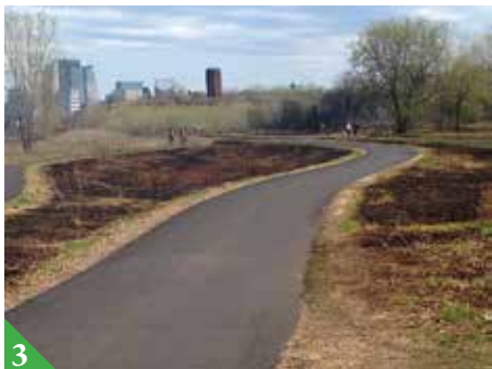
3 After 8 years of waiting and gentle encouragement, this spring saw the controlled burn of the Cedar Lake Park prairie restoration. Fire is a necessary component of prairie management in order to remove non-native and woody vegetation; native prairie plants with their deep roots are unaffected, and nourished by the return of nutrients to the soil. Kudos to Park Board staff!