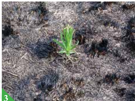
3 After 8 years of waiting and gentle encouragement, this spring saw the controlled burn of the Cedar Lake Park prairie restoration. Fire is a necessary component of prairie management in order to remove non-native and woody vegetation; native prairie plants with their deep roots are unaffected, and nourished by the return of nutrients to the soil. Kudos to Park Board staff!