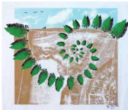
A stylized view of the Memorial Cedar Grove, located in the Heart of the park off the northeast corner of the lake. We will have a video tour on our website later this year, as well as names of honorees and donors.