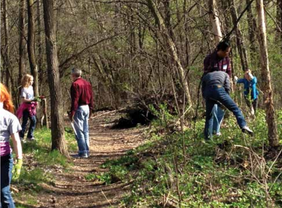
Volunteers work in the park on a beautiful morning.

For the sixth year in a row alumni of Yale University came to southern Cedar Lake Park to work on CLPA's Burnham Woodlands Restoration project. On a beautiful Saturday morning in May, they removed invasive buckthorn, pulled garlic mustard, learned about local ecology, nourished community and cleared a storm-closed central trail. The effort was part of the annual Yale Day of Service, and a good time was had by all.