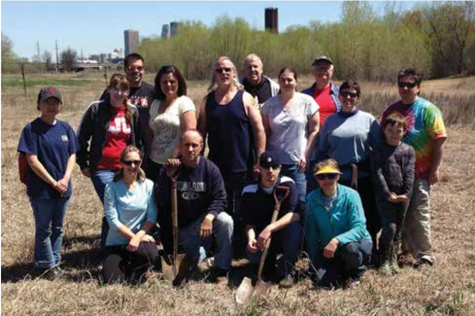
For the 14th year in a row, volunteers from Data Recognition Corporation and members of CLPA planted native-species wildflowers in the Cedar Lake Park Prairie. This year we planted on May 30, 2014.