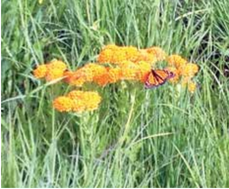
Butterfly weed with butterfly