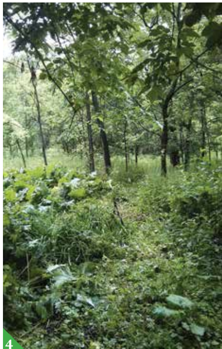
4 The beginnings of the outdoor education Nature Path in cooperation with Kenwood School and Hennepin County, located near W21st / Thomas ave S.